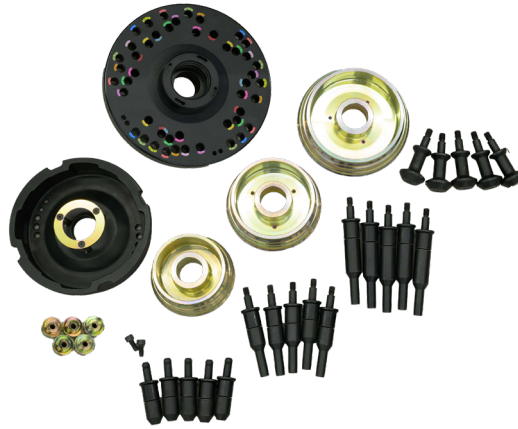
Full Kit also comes with two M10x1,50 20mm cap head screws.