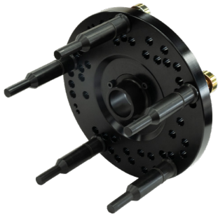
Assembled Pin Plate with Pins