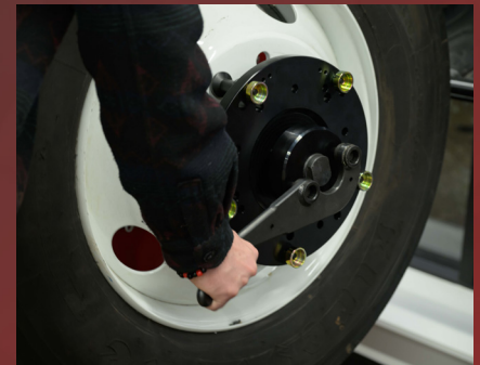
Heavy Duty Truck Kit for 50mm Shaft is being tightened on a Coats 6450 HD Balancer

Kit Includes: Full kit also comes with two M10x1,50 20mm cap head screws.