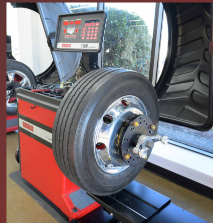
Medium Truck Kit for 40mm Shaft in use

Kit Includes: Full kit also comes with two M10x1,50 20mm cap head screws.